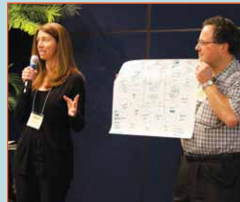
Summit photos: Dan Zaitz